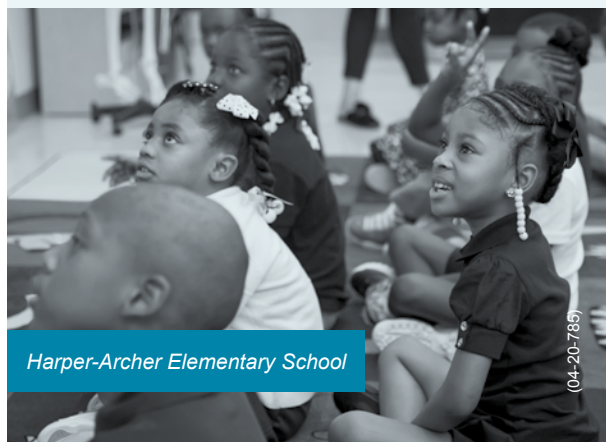
Harper-Archer Elementary School

* Note: Depending on the number of instructional days lost to inclement weather, instructional time may be made up by any combination of make-up days, virtual learning days or extension of the school day. Visit www.atlantapublicschools.us for the latest weather-related news.